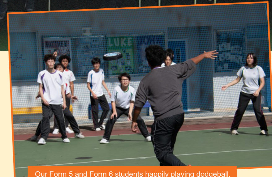
Our Form 5 and Form 6 students happily playing dodgeball.