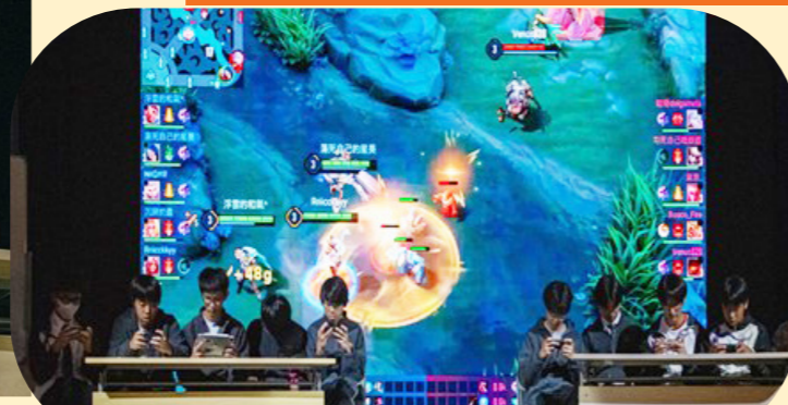
Look at how focused they are. They are definitely determined to win.