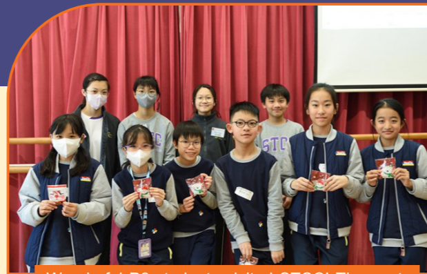
Wonderful P6 students visited STCC! They got souvenirs prepared by the Student Union! What a wonderful time!