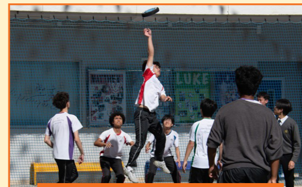
Look at how competitive our students are.