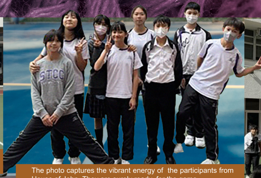
The photo captures the vibrant energy of the participants from House of John. They are surely ready for the game.