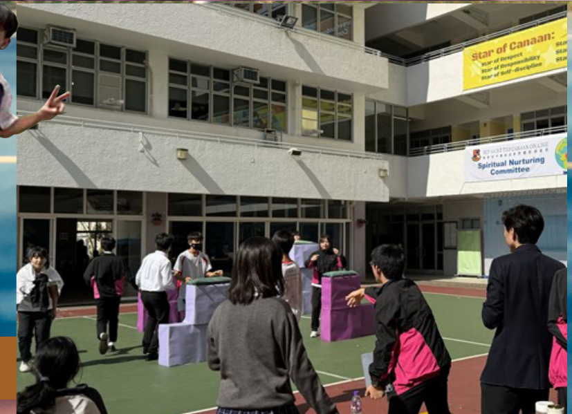
The gestures of the participants from House of Matthew reflect their passion for the game showcasing their team spirit and dedication.