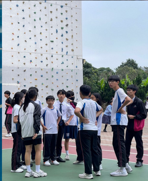
The participants of House of Mark engage in a focused discussion, strategizing before the house activity. Their facial expressions reflect their commitment and seriousness.