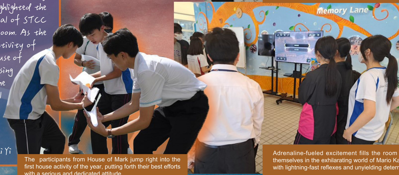
The participants from House of Mark jump right into the first house activity of the year, putting forth their best efforts with a serious and dedicated attitude.