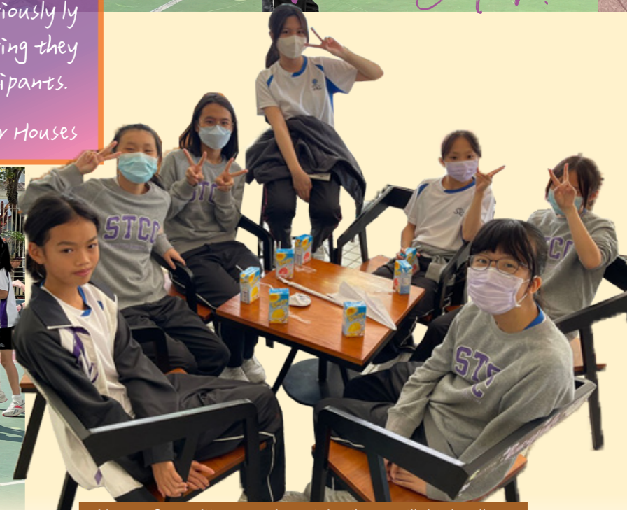
House Committee members take the spotlight, leading a small group discussion on Sports Day preparation.