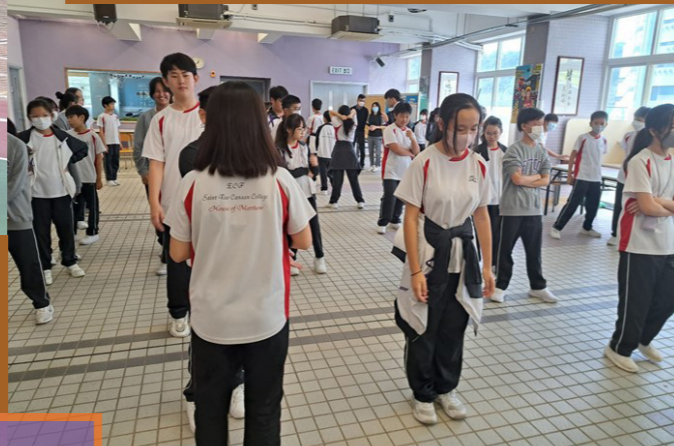
Giggles and whispers ripple through the line as the participants engage in an uproarious game of Chinese Whispers, passing on secrets and laughter with infectious enthusiasm, creating a chain of amusement that stretches from ear to ear.