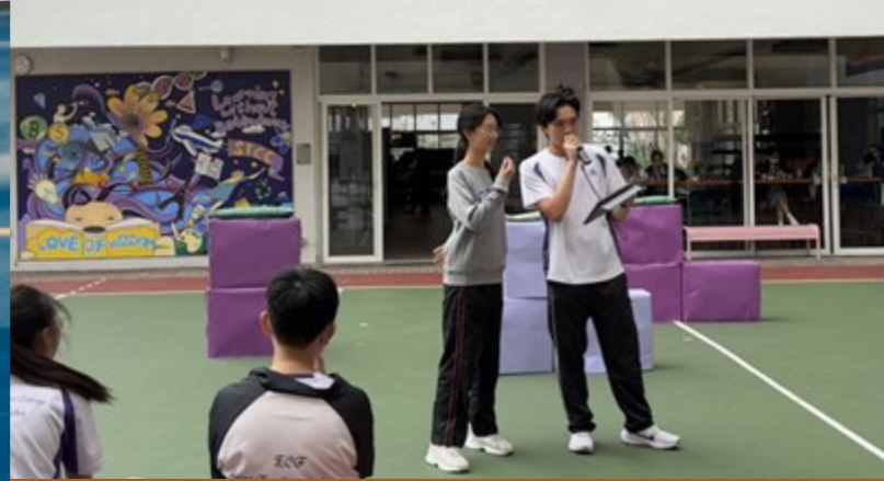
Committees of House of John deliver the rules of the game to the audiences and participants.