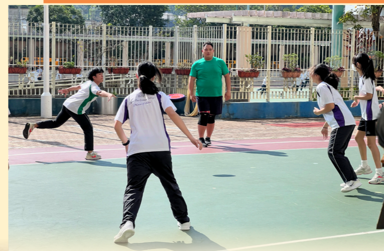
House of Luke is going to win this game!