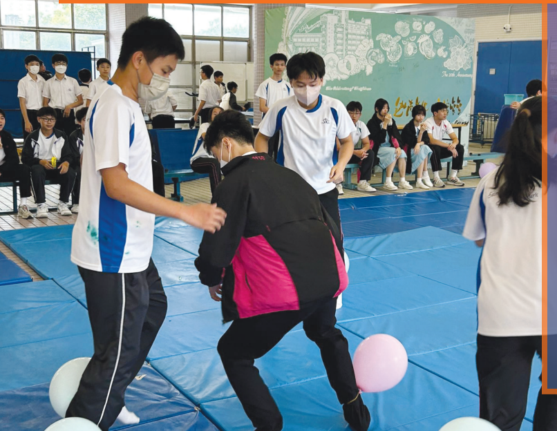
Students sit aside to cheer up and support their House members.

Our House Captains and committee members made a big contribution in organizing and hosting the event. They decided to have fun mini games. Even though they did worry about the safety problem of the game at the beginning, they tried out the games themselves a couple of times and made sure they were safe before the activity week. It was amazing to see how hard they worked and everyone in the committee helped and took part in the activities. The activities went really well and all the students had a fantastic and wonderful time.