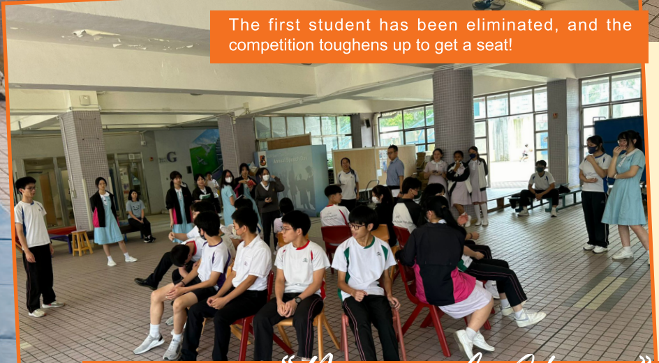
Everyone is ready for the "Musical Chairs"!