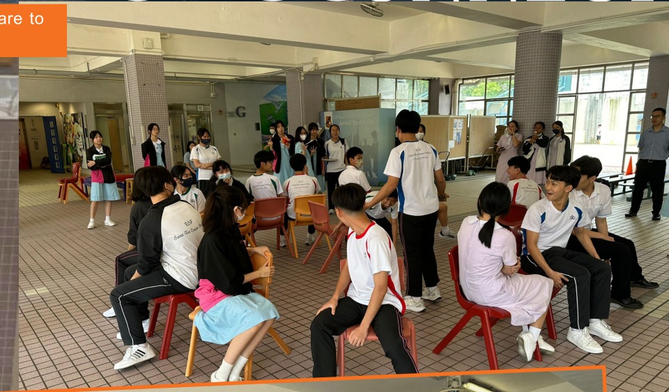
The first student has been eliminated, and the competition toughens up to get a seat!