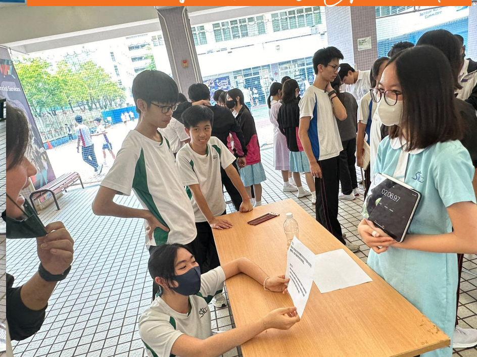
Students take the challenge and master the tricky "Tongue Twister"!