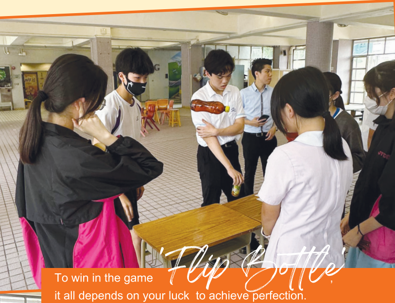
To win in the game it all depends on your luck to achieve perfection.