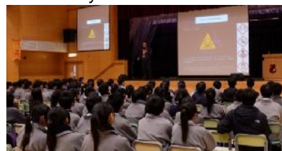
Science Talk by HKU Lecturer@STCC