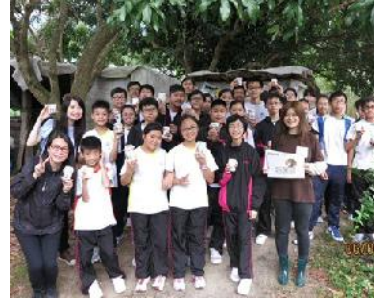
Mushroom Farm Visit