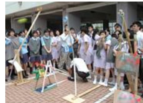
Canaan Catapult competition