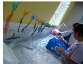
Leaf Vein Bookmark Activity