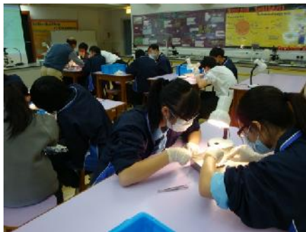
Dissection of Grasshopper Activity