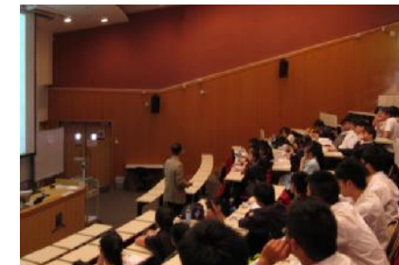
CUHK Science Faculty Visit