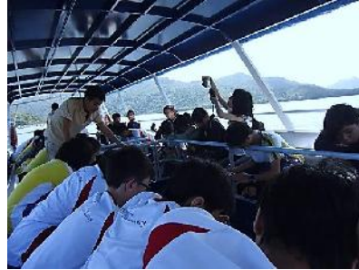
Hoi Ha Wan Marine Life Education Centre Visit