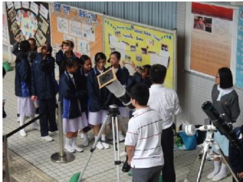
Sun Spots Observation Activity