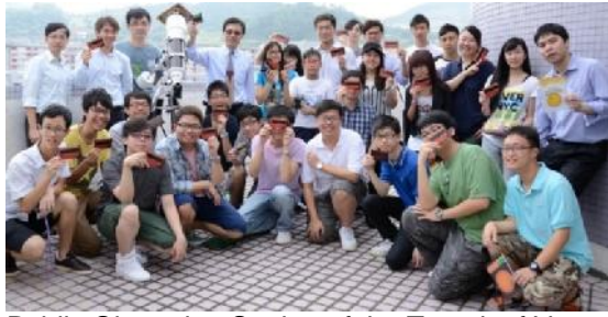
Public Observing Station of the Transit of Venus (In cooperated with Hong Kong Space Museum, HKU, Ho Koon Nature Education and Hong Kong Astronomical Society)

Through science exploratory activities held by each subject and science society with interesting sciences topics, students can cultivate a curiosity about the world and develop an interest in science, and thus they can become active learners in science. Furthermore, these experiences enable students to learn to appreciate and understand the beauty and nature of science and become lifelong learners in science and technology.