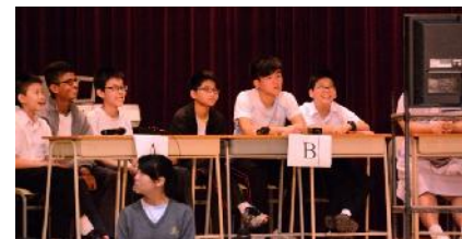
Inter-class Science Competition