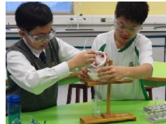
Chemistry workshop - Natural indicator